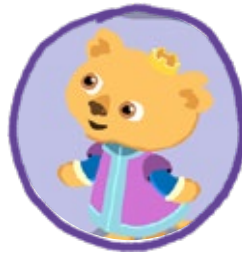
Prince Hal Son