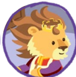
Lion King Henry IV