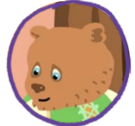
Falstaff the Bear