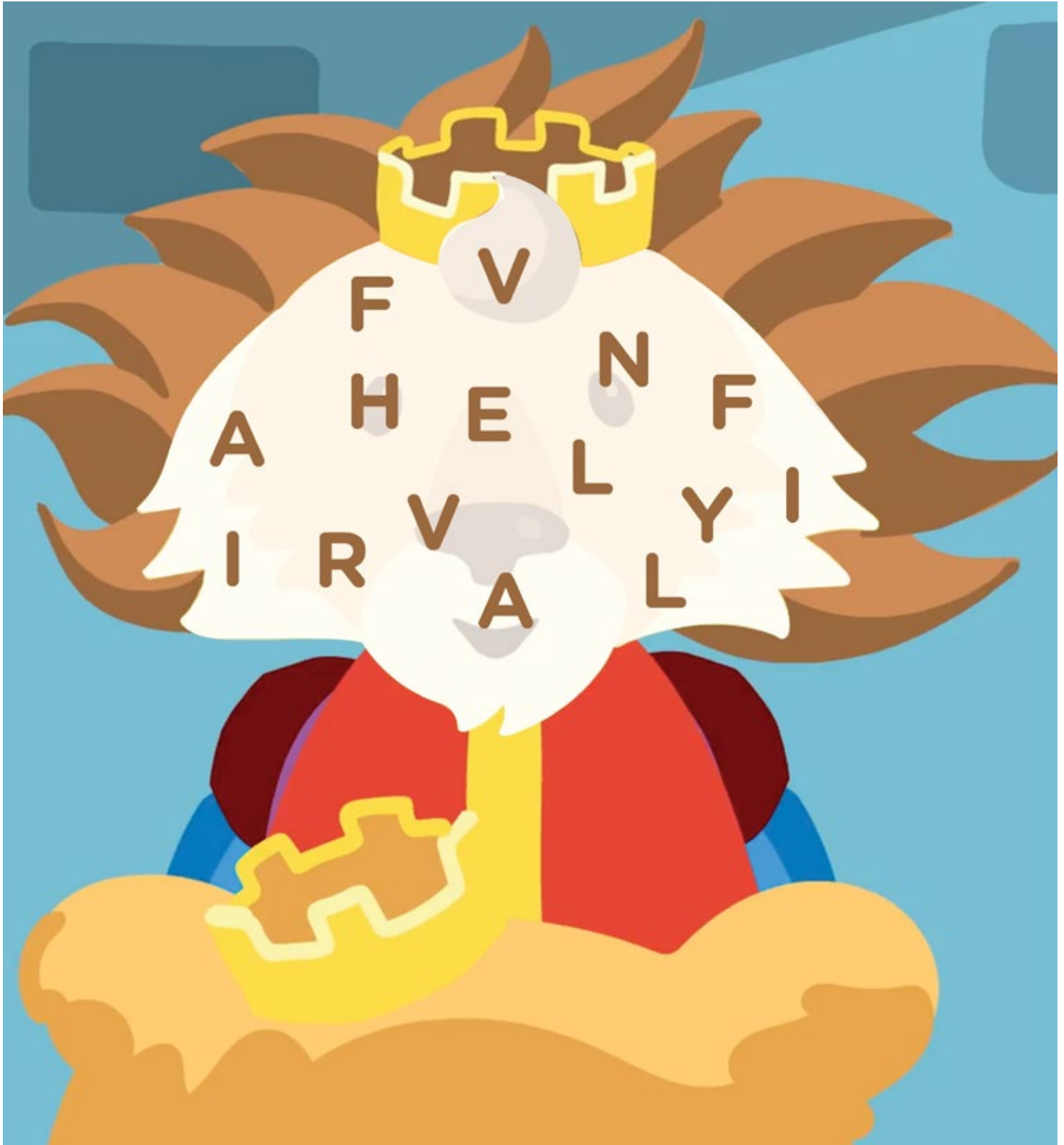
The Brave Lion Cub

Instruction: Cross out the letters that appear twice to leave the name of the king this crown belongs to.